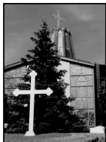
St. George Antiochian Orthodox Christian Church 237 Long Hill Road Little Falls, NJ 07424-0217

Isn't it strange how we send jokes in e-mails and they are forwarded right away but when we are going to send messages about God, we think about it twice before we share it with others?